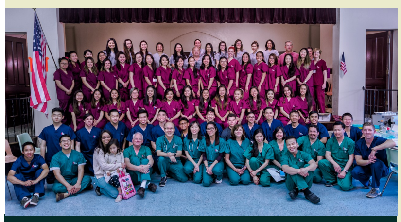
GSMDM APRIL CLINIC TEAM

Chick-Fil-A provided a free lunch for all the volunteers.